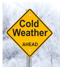
Winter Weather Alerts