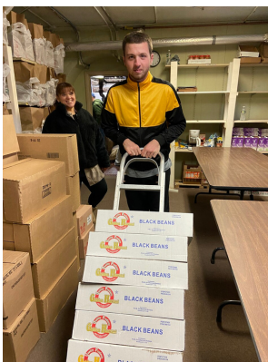
SMEC Students Volunteer at End Hunger New England's Meal Packaging Event