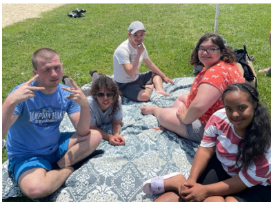
TSP Students Wrap Up the School Year at Fort Phoenix