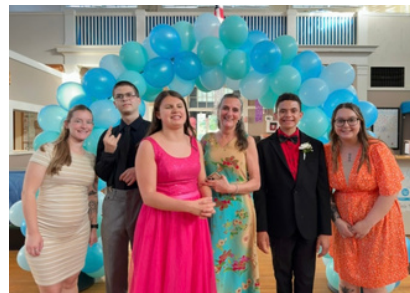
TSP & ISP II Students Go To PROM!